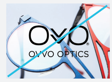
Do not place the logo on backgrounds that interferes with its legibility.