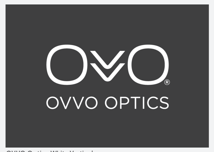
OVVO Optics White Vertical