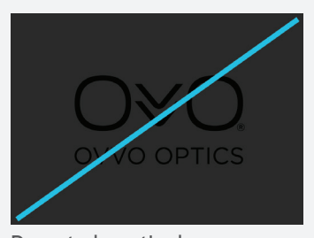
Do not place the logo on backgrounds that provide little contrast.