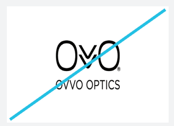
Do not stretch or rotate.