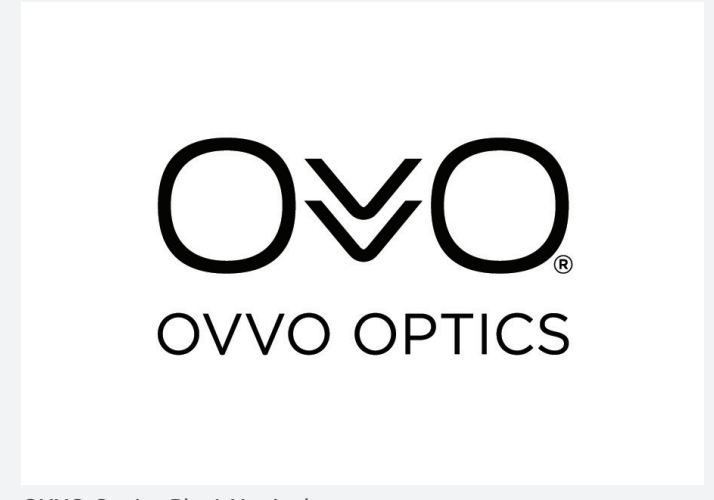
OVVO Optics Black Vertical