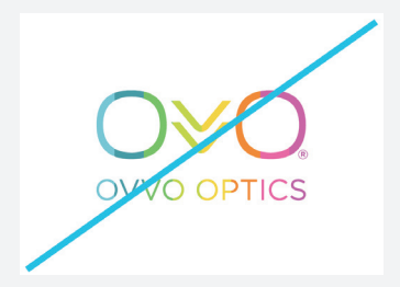
Do not fill with multiple colors.